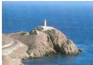
Cape of Gata